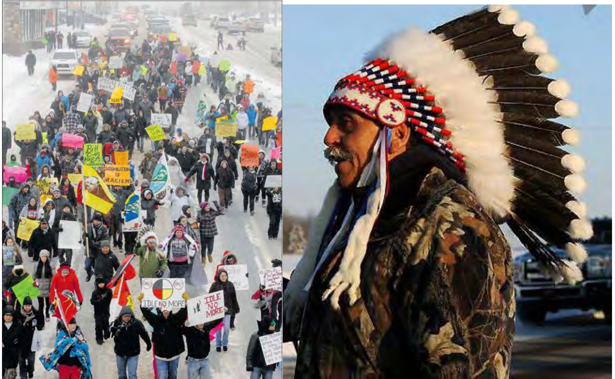
Table of Contents- January 2013

FIRST NATIONS GROUP STAGES DEMONSTRATION AT N.B. LEGISLATURE